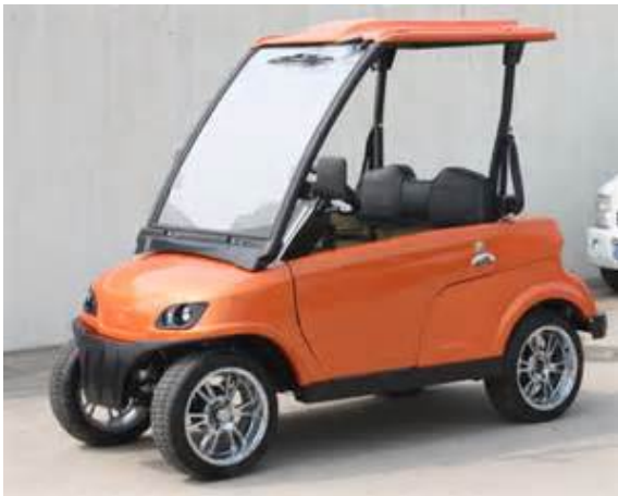
Smart Forto Golf