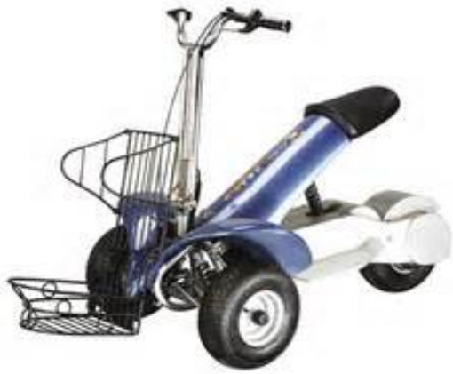
"Would Love to Have One"