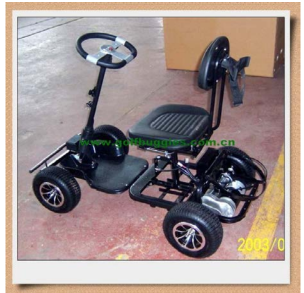
"Not a Bad Ride"