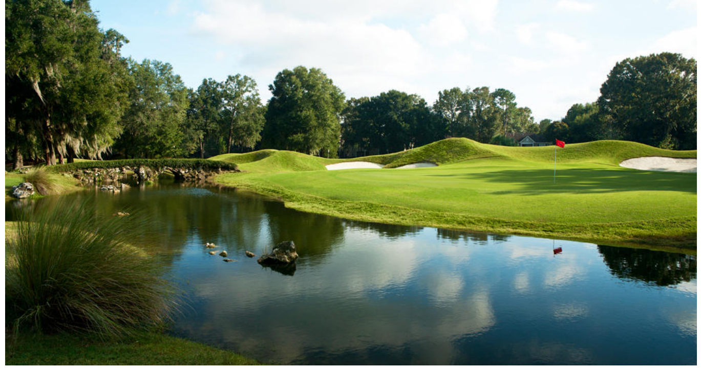
Hate when this happens, just go in already