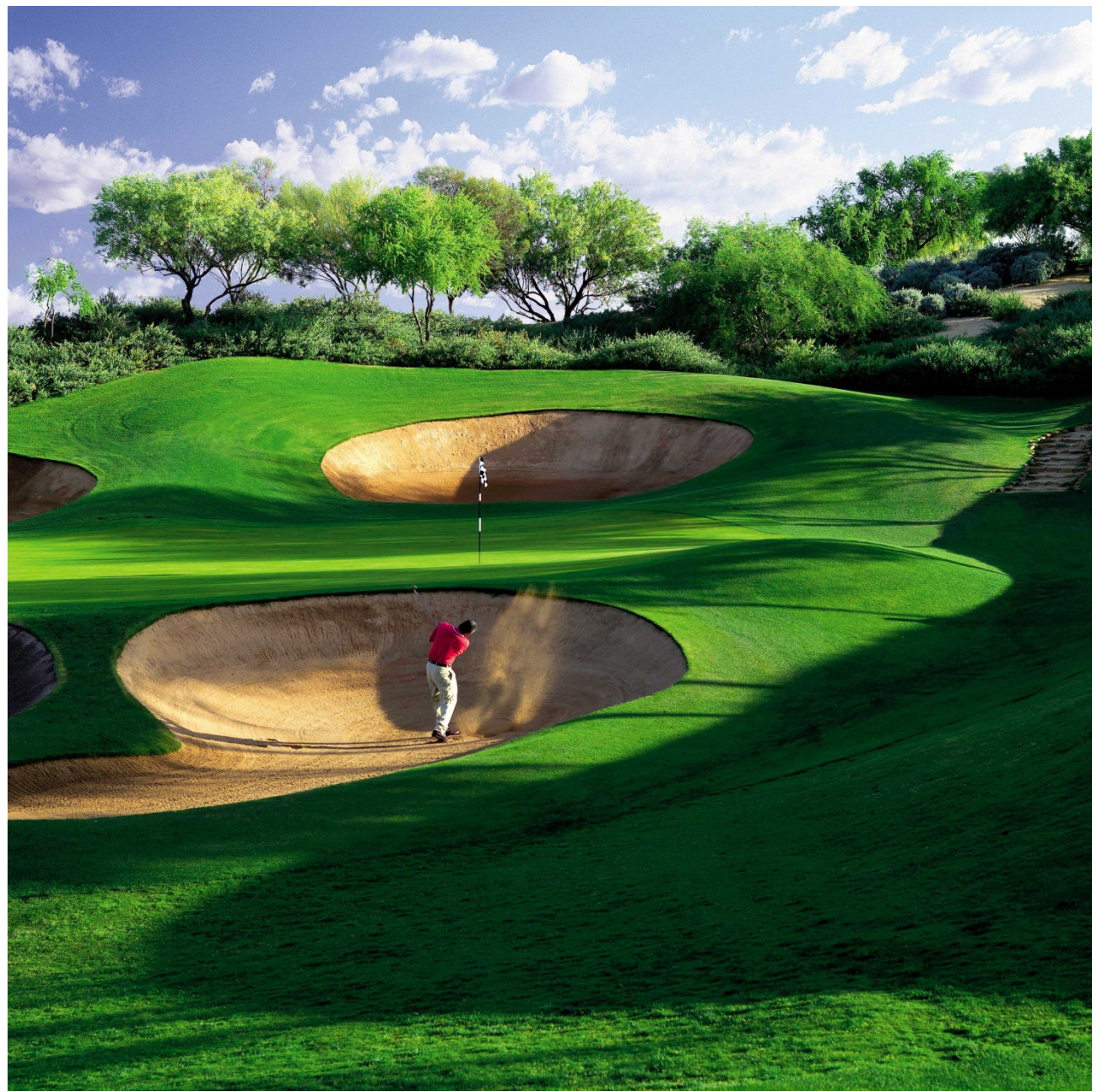
Place that Shot Mister !!!!!!!