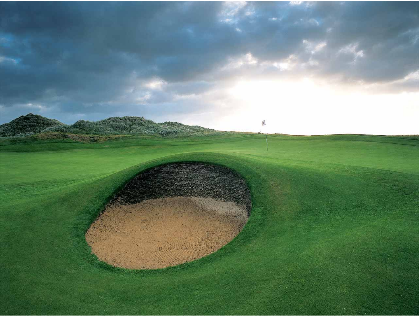
Gorgeous Views from 2 Great Courses