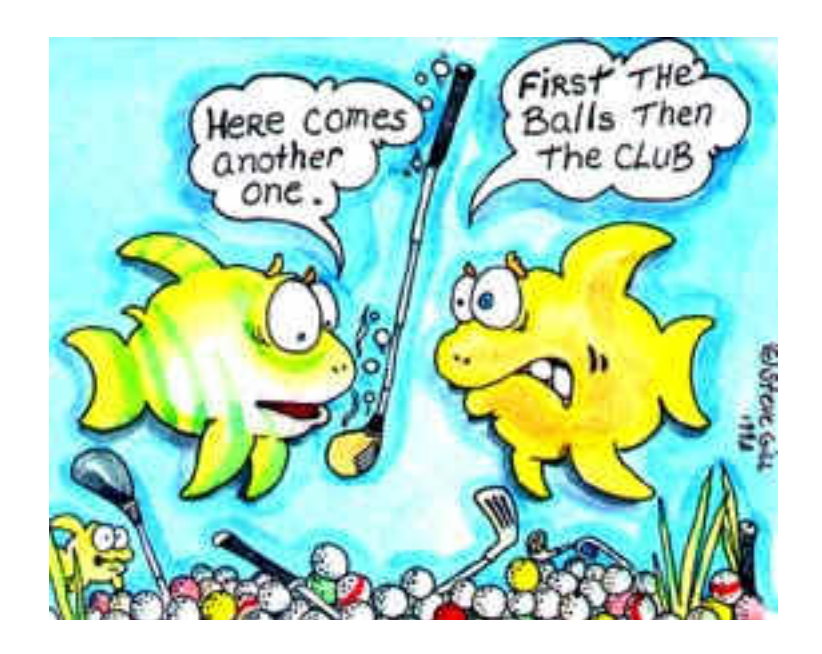
Great Pictures of the Week