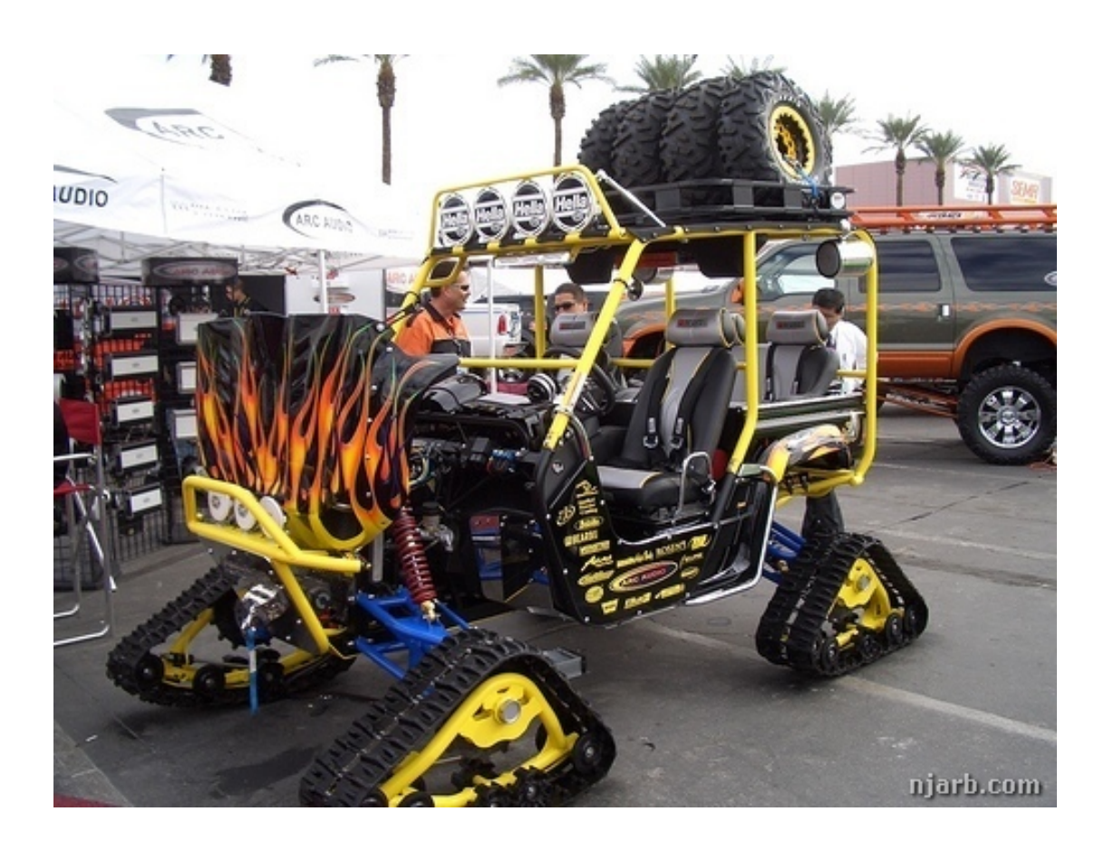
Or this one