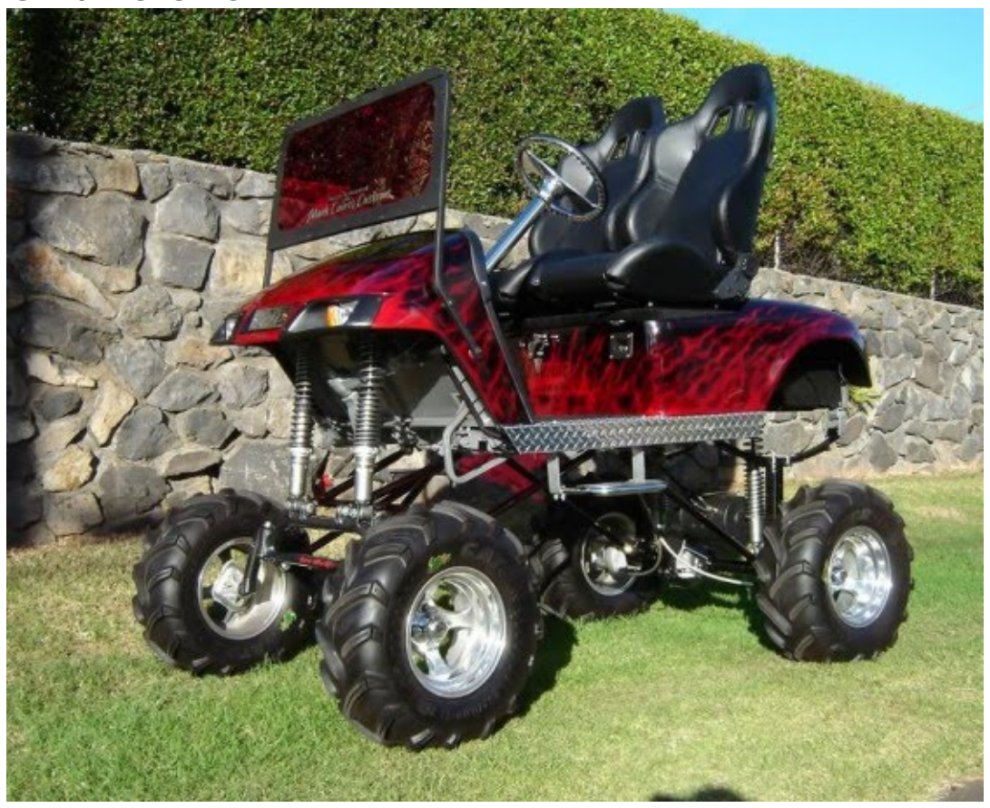
Some more Cool Carts