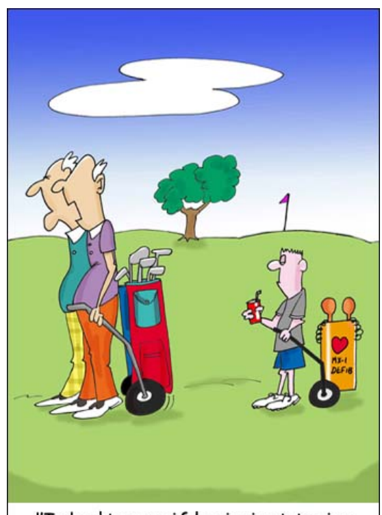
"I don't care if he is just trying to make a buck, following us with that defibrillator is unnerving."