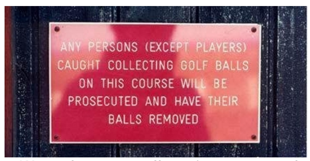
Wow, they are really trying to get to the root of this.