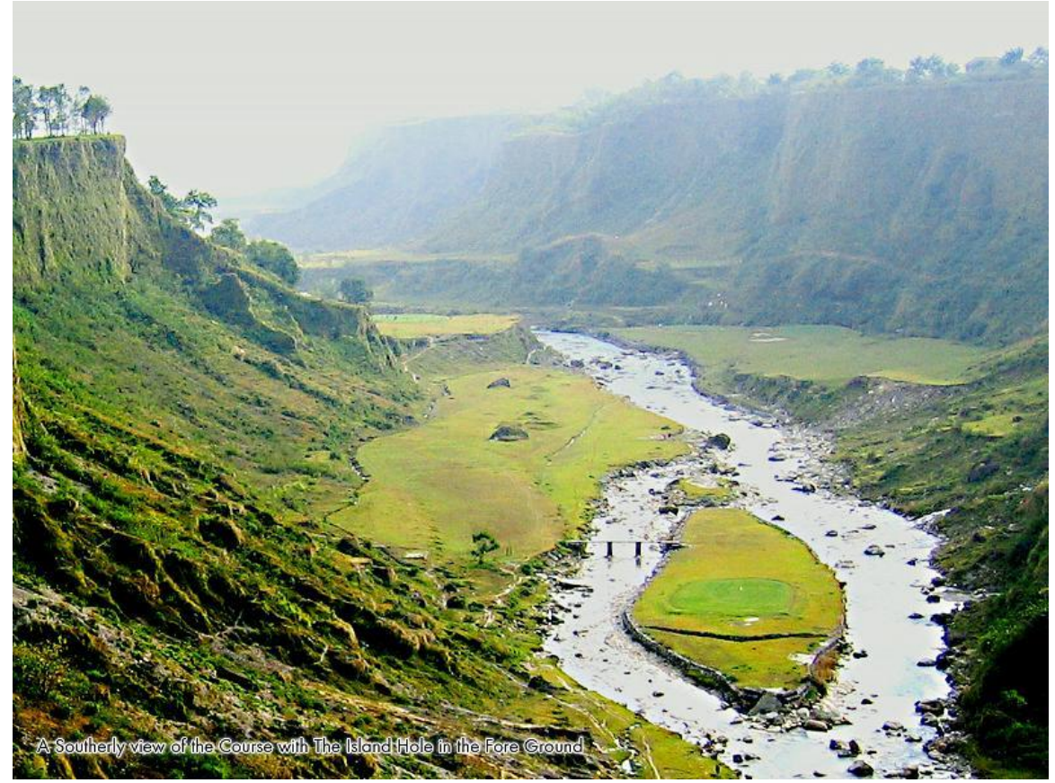
Now this is an Island Green - I wonder if it ever floods.