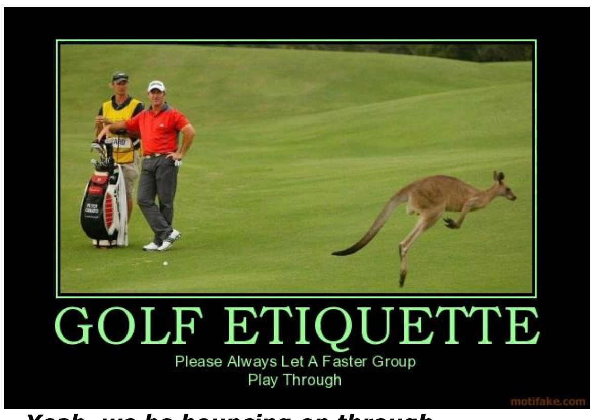
Yeah, we be bouncing on through.