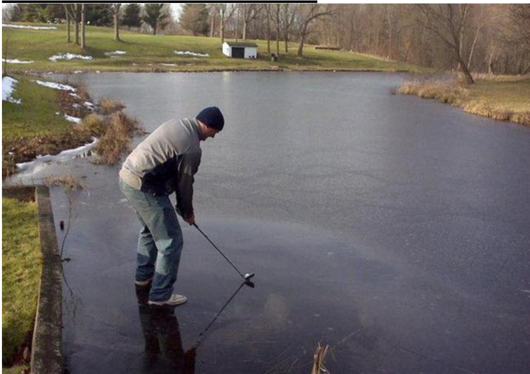
This Ice will hold I Guarantee – I was an Idiot !!