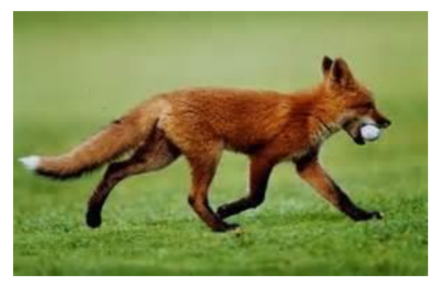
I Got the Ball and you can't have it.