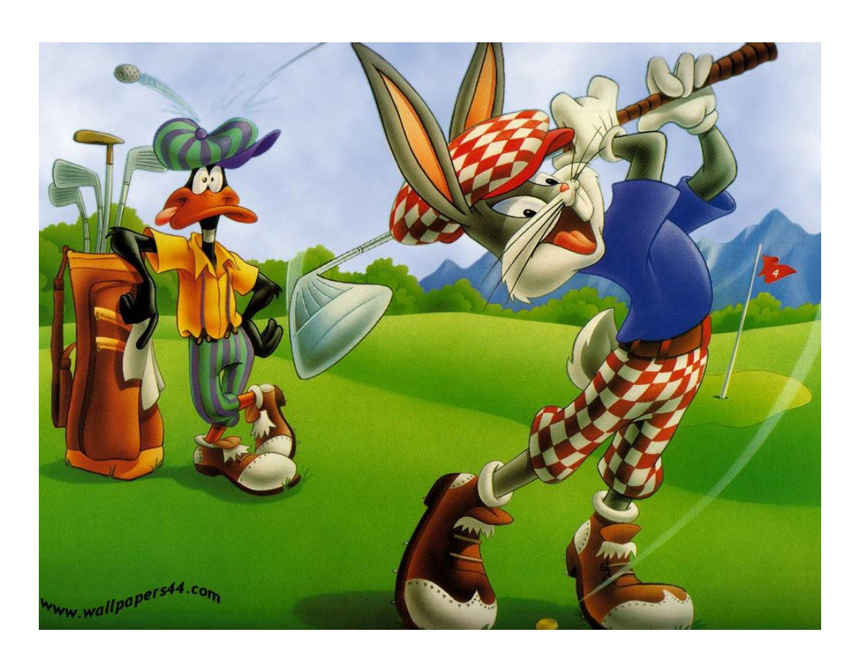
HAVE A GREAT ROUND