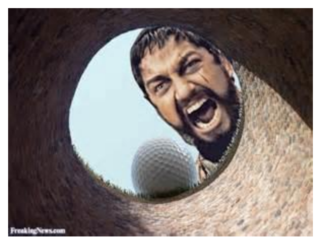
We are the NUWC Golf League.