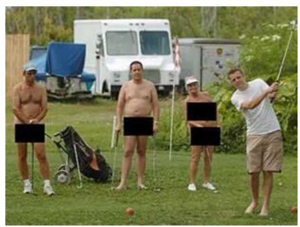
This is why we have clothes on.