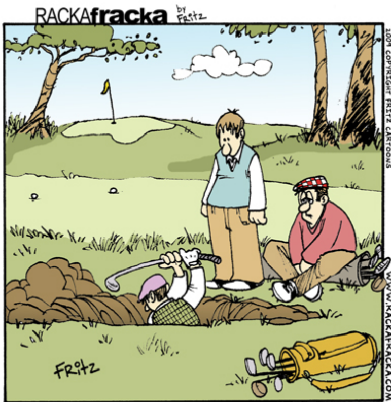
DAN TAKES YET ANOTHER PRACTICE SWING.