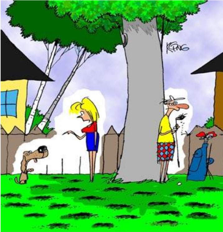
"Bad Dog! Dig up my lawn again and I'll have you neutered!"