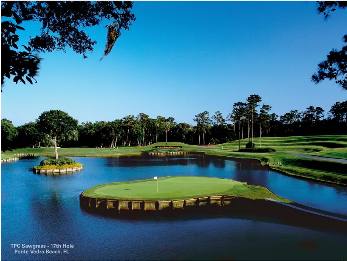
TPC Sawgrass - 17th Hole Ponte Vedra Beach, FL